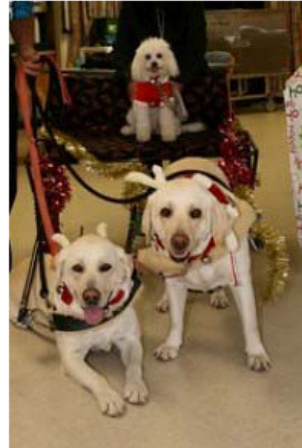
Photo: Riley, Stitch, and Sophie play Santa's helpers at the Loma Linda VA Hospital during Moreno Valley Lodge's Christmas Eve caroling event.