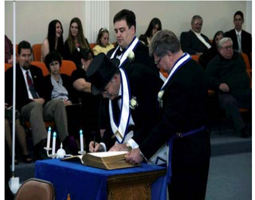
Installation photos